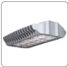
Opto Lego LED Modul